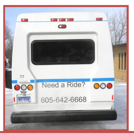
$75 single line back $120/month back window