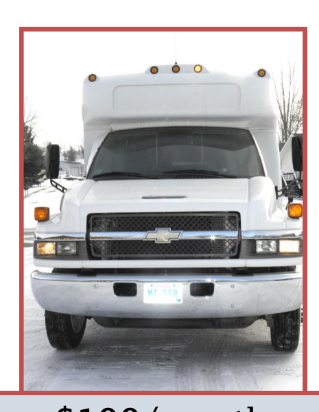
$100/month for top front